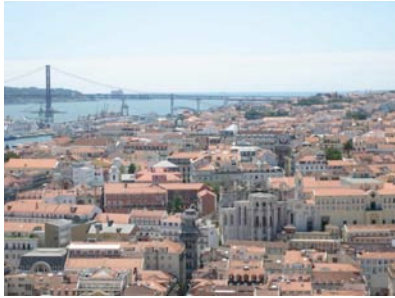
View over Lisbon