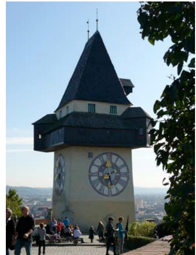
The clock tower in Graz

The symposium „Reconciliation as a part of psychotherapy“ did not only offer impressive speeches but also gave us a chance to get to know colleagues from Styria.